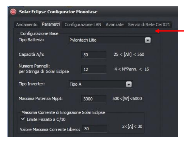
Figure 3 - Settings for n. 1 Pylontech US2000B / Extra 2000 battery

NOTE : Up to 4 Pylontech batteries can be installed on each Solar Eclipse. If the batteries are 4 set capacity 200 Ah.